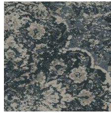
Timeless 85402 LRV 24.6