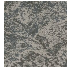
Heritage 85530 LRV 15.4