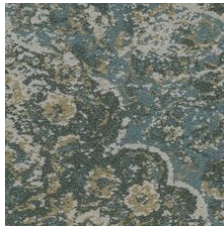
Novelty 85327 LRV 21.2