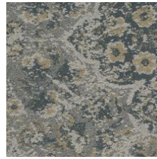
Classic 85496 LRV 23.6