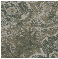
Recollect 85215 LRV 24.4