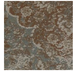
Nostalgic 85665 LRV 14.7